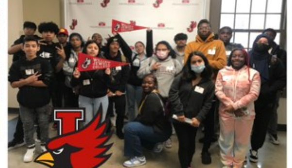
William Jewell Visit, September 23rd