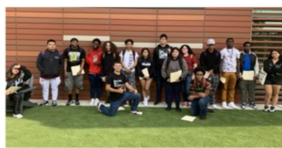
UMKC Visit, September 15th